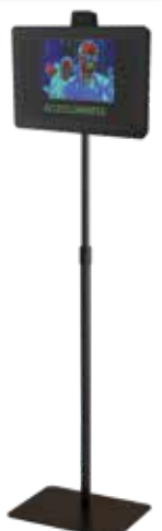
APS-1 pole stand