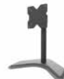
DTM-2 desktop mount