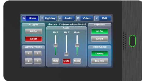
Landscape and Portrait Mounting

The RXT-7 is the world's first ReAX™ JavaScript based Touch Panel/Control System. Ideal for conference rooms, educational facilities, digital signage and more. Designed to flush mount magnetically into the RXT-BB7 back box, the RXT-7 has a beautiful 1024 x 600 touch screen with 170 degree viewing and room status lighting. The 2D and 3D graphics engine with 1080p H.264 streaming decoder provides a powerful solution for complex graphics and video, ensuring an enhanced user experience.